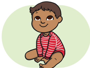
el bebé baby