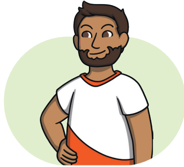
el papá father