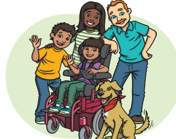
la familia family