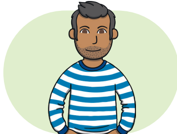
el padrastro stepfather