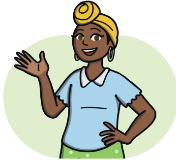
la mamá mother