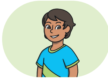
el hijo son