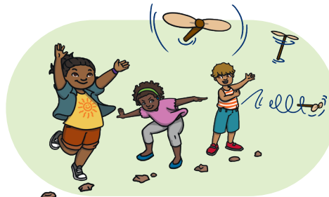
los primos cousins