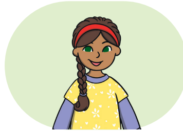
la hija daughter