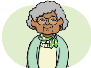
la abuela grandmother