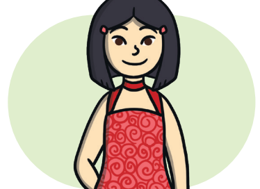
la tía aunt