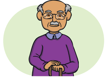
el abuelo grandfather